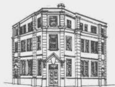
Cavendish House 153-157 London Road Derby DE1 2SY