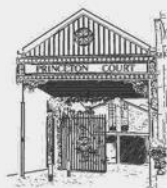
The Cavendish Gallery 7 Princeton Court, Putney London SW15 1AZ