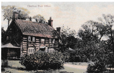
Cheriton Post Office. Posted to Culver House, Winchester. Single circular Cheriton Hants Post mark JU 10 07.